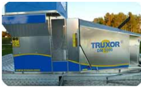
The air intake to the radiator has a filter that prevents insects, etc. from getting caught in the cells of the radiator.