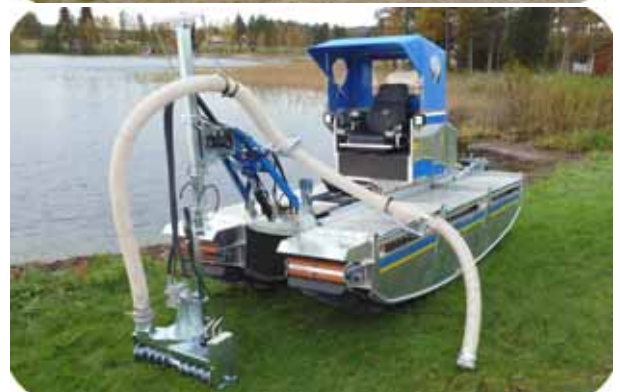
The Doro Pump with extension (78-2502) and telescope (94-58400).