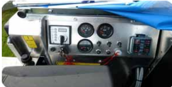
The instruments show hydraulic pressure, fuel level, motor temperature, hydraulic oil temperature, a chronometer and the motor revolutions as well as regulate the speed of the tracks. The start panel has a built-in stop function if the motor overheats or oil pressure is too low.