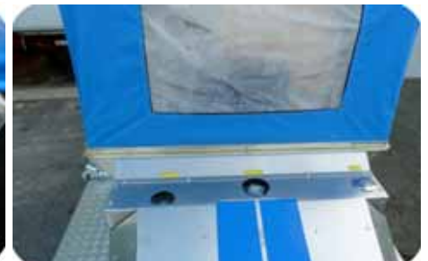
Easy-to-access diesel tank and a hydraulic oil tank for the control and refilling of fluids.