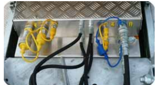
Hydraulic outlet for operation of tools; regulated using a joystick.