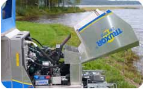
The engine cover is opened as shown. A tool box is located inside the engine compartment.