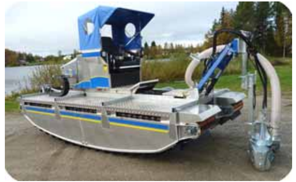
The complete Doro Pump (78-2502)

Suction dredging in pure sand is performed with a suction tube which is mounted in the inlet of the pump. The Doro Pump is delivered with a mechanical bracket. As an accessory, the Doro Pump can also be delivered with a hydraulically operated telescopic extension, which will increase the dredging depth and facilitate manoeuvring.