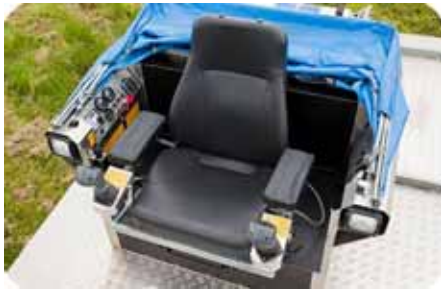
Ergonomic driver's seat with joysticks for regulation of steering, speed and tools.